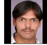
Bharat Vikas 82976 71717